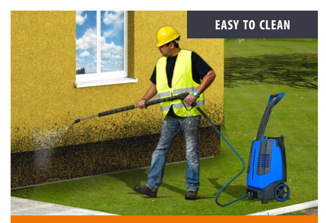
By pressure washing you can easily and quickly refresh the facade and remove any grime, stains and dirt from it.