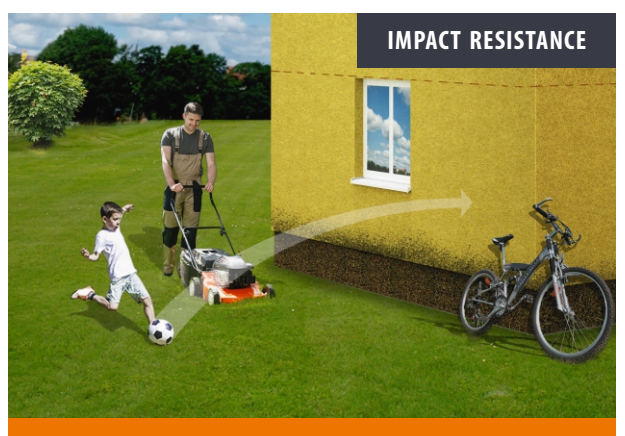
Several times higher impact resistance in the part of wall exposed to mechanical stresses.